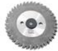
6in HSS Slitting blade