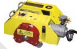
Model E Pneumatic

* STANDARD EQUIPMENT INCLUDES A BASIC MOUNTING CHAIN FOR OD 6IN - 48IN (152-1219MM) ONLY.