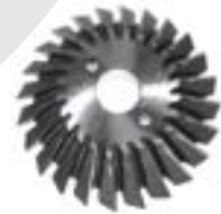
6in 30° Left Hand Bevel cutter