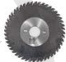
7in HSS Slitting blade