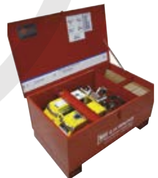
Heavy duty steel storage case hinges open for easy access