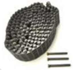
Chain assembly & pins