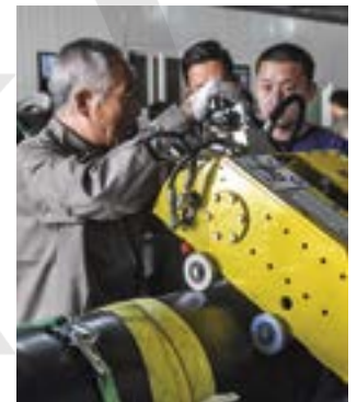
Trav-L-Cutter is in use worldwide