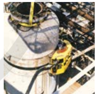
Add mounting chain sections to fit larger diameters