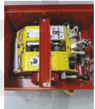
Trav-L-Cutter shown in steel storage case