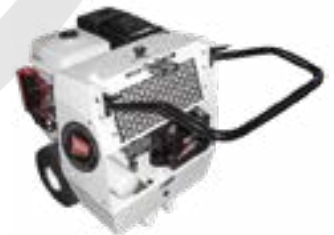
Gasoline Driven HPU Hydraulic Power Unit