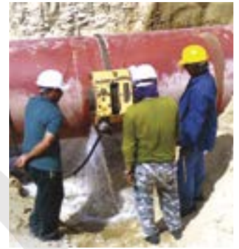
Horizontal & vertical cutting