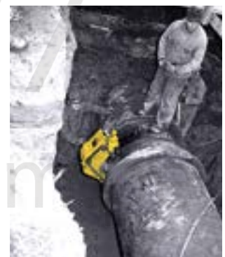
First generation Trav-L-Cutter photo circa 1952