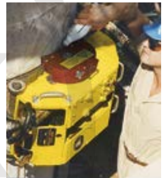
Fast & accurate cutting & beveling