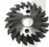
5in 30° Left Hand Bevel cutter