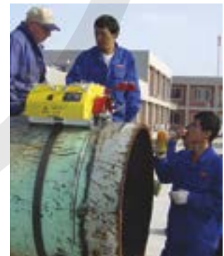
Trav-L-Cutter is designed for pipeline operations.