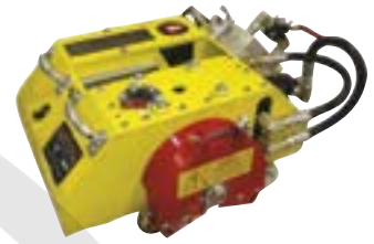
Model HE Hydraulic